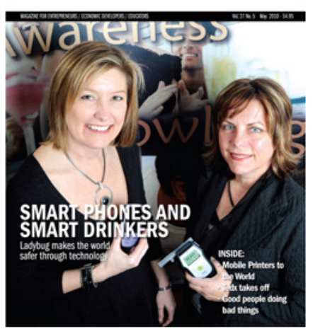
Subscribe to Exchange News Daily